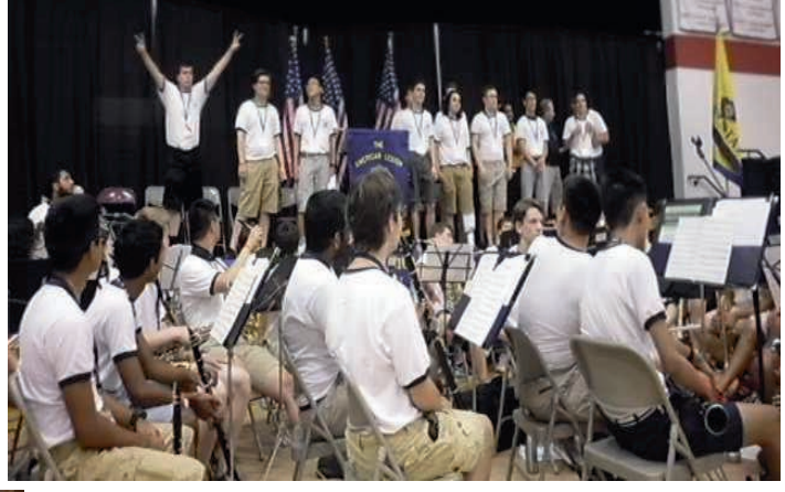
The Boys State Chorus takes the stage as the band prepares "The Battle Hymn of the Republic." Photo Credit: Collin Tofts

Boys begin both physical and mental preparations for Wednesday night's municipal trial. Photo Credit: Collin Tofts